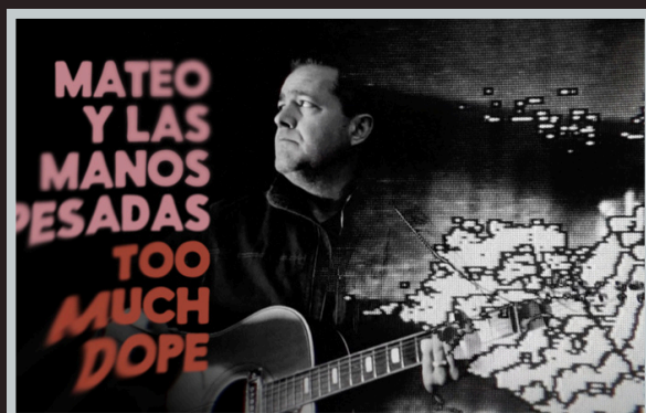
I Don't Smoke (Too Much Dope)

More videos on the official YouTube channel of Mateo y Las Manos Pesadas