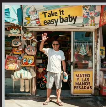
Take It Easy Baby