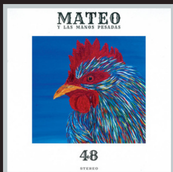
I Kinda Like Her Way

Available on all music streaming platforms