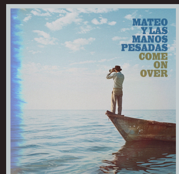
Come On Over